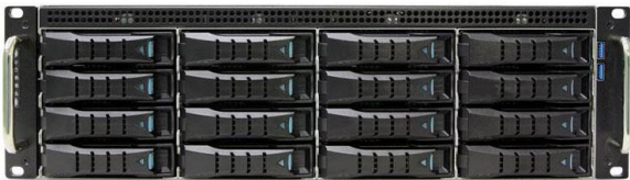
Dual Xeon, Windows, SSD + RAID-5

Fairway-Express Broadcast Server.....$7,850 (2RU Chassis, Reduced Features and Options)