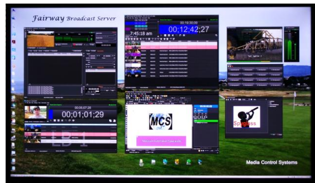
Real-time Status, Control, and A/V Monitoring

Media Control Systems has teamed with Athensa to produce integrated cost effective broadcast automation solutions. Emmy award winning Media Control Systems provides the manufacturing and integration capability, while Athensa provides world class broadcast automation software and support.